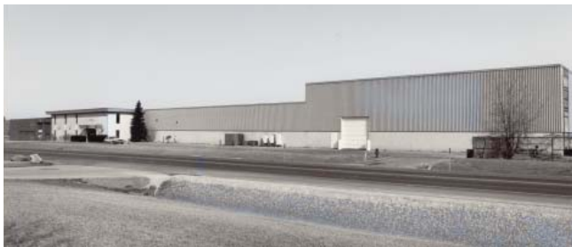
124th Street Facility in Wauwatosa, Wisconsin