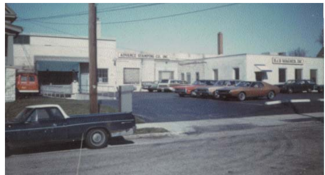
Gladstone Avenue Facility in Milwaukee, Wisconsin circa 1964