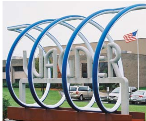
The Wagner Companies