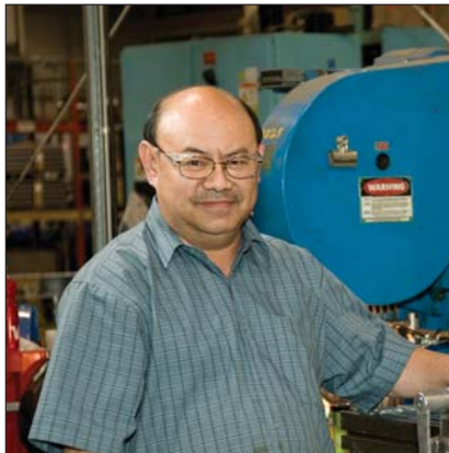
Nenglaur • Plant 2

You will need to provide an air compressor capable of delivering at least 5.8 c.f.m. at 90 p.s.i. and a minimum 20-gallon tank. Minimum 1/4" I.D. air hose with a 1/4" male pipe thread required (not included).