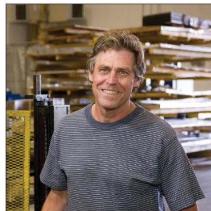
Jim • Press